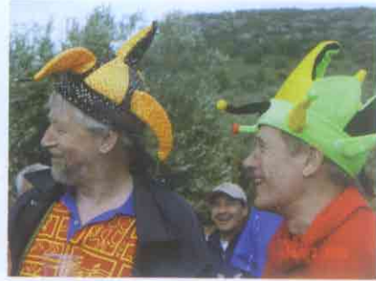
Class downs "Strawberry 4 Skin" and "Self Service"

Besides the normal runs, every extraordinary event is made into a special occasion. "Bookmaker's" AHHH Run No. 600, for example, was celebrated in February as a joint AHHH and "Athens Full Moon HHH" extravaganza at the beach of Porto Germanos on the shores of the Golf of Corinth, with great runs