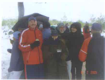
Even in subzero temperatures AHHH is having fun