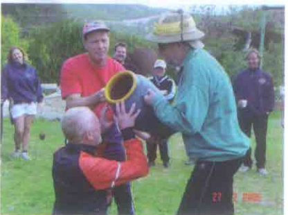
Bookmaker gets his Run 600 jug